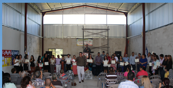
Nuevo Amanecer, Santa Ana, Levels 1 & 2 33 graduates