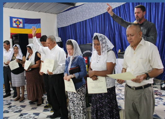
Usulután, rural church, extended 9-week class graduation, 2016