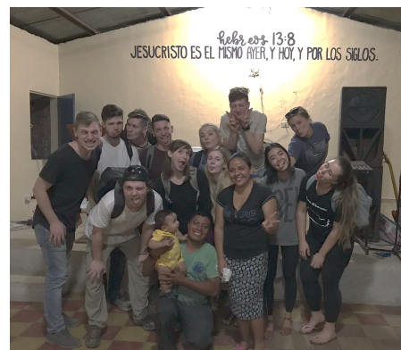
Pictured: the team in the new church plant in Gualache

We appreciate the energy and life that our teams bring to the ministry in El Salvador!